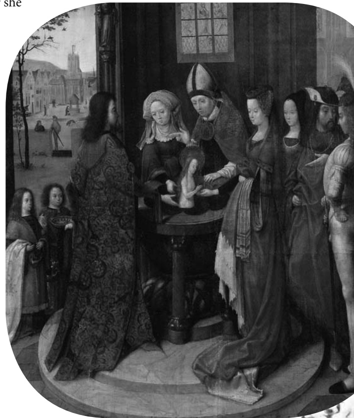
Baptism of St. Ursula / Scala / Art Resource, NY

Consider the effects of your Baptism and your own life of faith, the faith you will profess at your child's Baptism. What is going well in your spiritual life? Where could you use some improvement to be the best model and guide for your child?