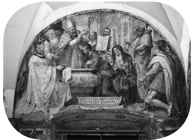
Saint Augustine being baptized by Saint Ambrose of Milan

The prayer uses the imagery of the Exodus to describe the spiritual reality of Baptism: freedom from slavery followed by a challenging journey. The prayer asks God to strengthen the child and watch over him or her throughout the journey of life. You are the first answer to that prayer. You are the first means by which God will protect and guide your child.