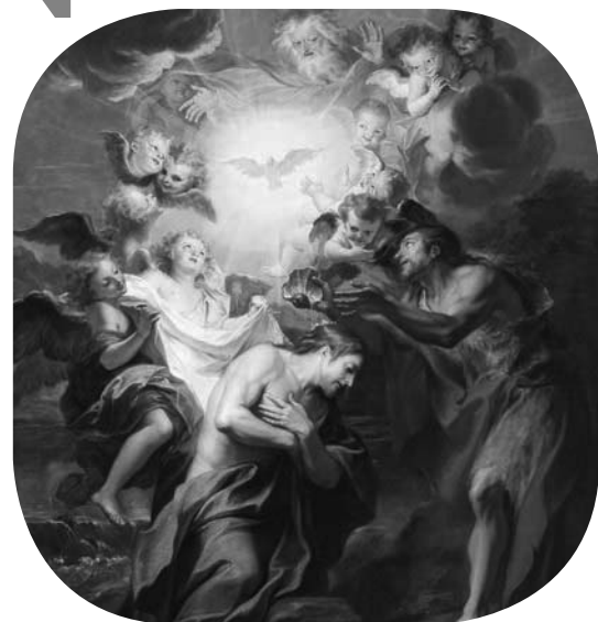
The Baptism of Christ

Heavenly Father, we thank you for the cleansing waters of Baptism. In this sacrament we are initiated into the story of salvation and we are sealed as your children. May we always cherish the precious gift of your grace and our place in your plan of salvation. We ask this through Jesus Christ our Lord. Amen.