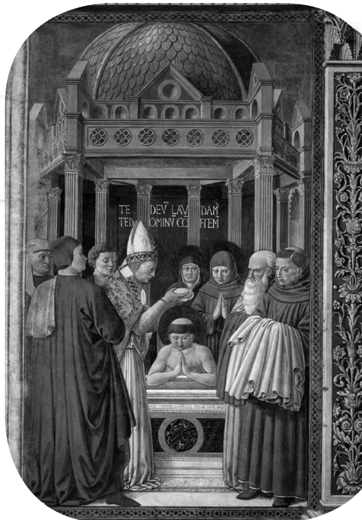
St. Ambrose baptizes St. Augustine